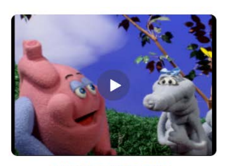
TALK TO A FRIEND.MP4