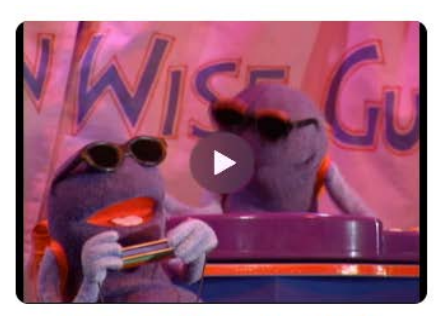
LOW DOWN KIDNEY BLUES.MP4