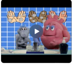
WASH YOUR HANDS BEFORE YOU EAT,MP4

Note: After all that fun, be sure to Wash Your Hands! To include handwashing information into this lesson you can add/replace one of the above videos with this Wash Your Hands Before You Eat Short.