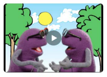
REPEAT AFTER ME.MP4