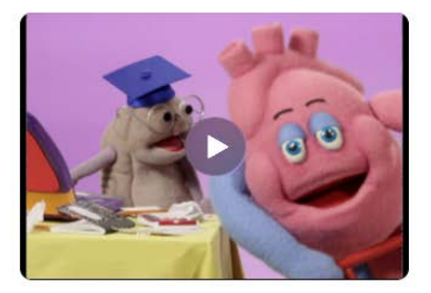
HOME WORK HOME PLAY.MP4