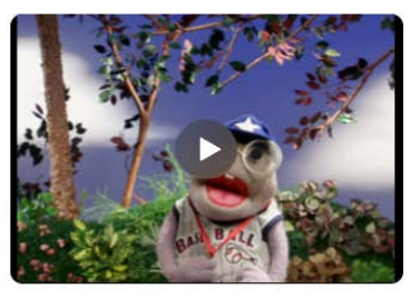
TEST TAKING IS LIKE BASEBALL.MP4

MUSIC/ARTS 16 songs with lyrics/12 drawing videos